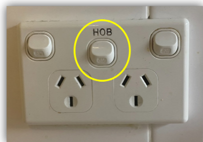
HOB power outlet

Cooktop not heating, check that the HOB switch is turned on.